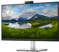
Dell 24 Video Conferencing Monitor - C2423H

Stay in sync on a 24-inch FHD monitor with built-in conferencing essentials, low blue light and an eco-friendly design.