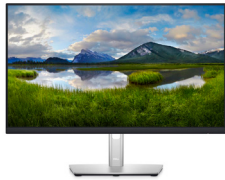
Dell 24 USB-C Hub Monitor - P2422HE

Stay productive, no matter where you work. Reduce harmful blue light with this sleek 23.8-inch FHD hub monitor with ComfortView Plus.