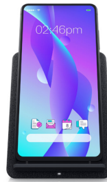
Dell Dual Dock - HD22Q

Experience industry leading video quality and picture clarity in any lighting with this intelligent 2K QHD webcam.