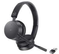
Dell Pro Wireless Headset - WL5022

Powerfully productive, this compact dock is the world's first laptop docking station with a wireless charging stand for Qi-enabled smartphone or earbuds.