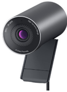
Dell Pro Webcam - WB5023

Stay productive, no matter where you work. Reduce harmful blue light with this sleek 23.8-inch FHD hub monitor with ComfortView Plus.